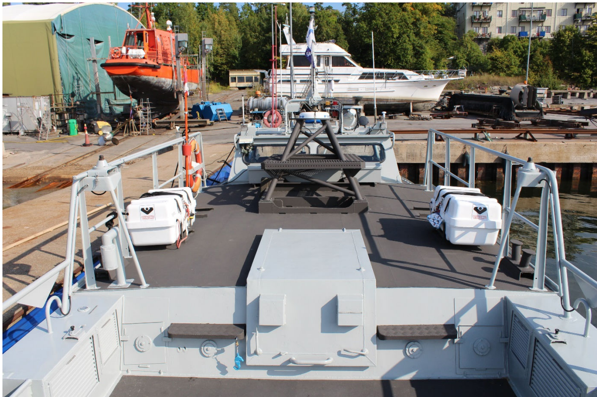
On Enforcer III the standard Ring Mount is replaced by a specially designed foundation for an RWS (Remote Operated Weapon).