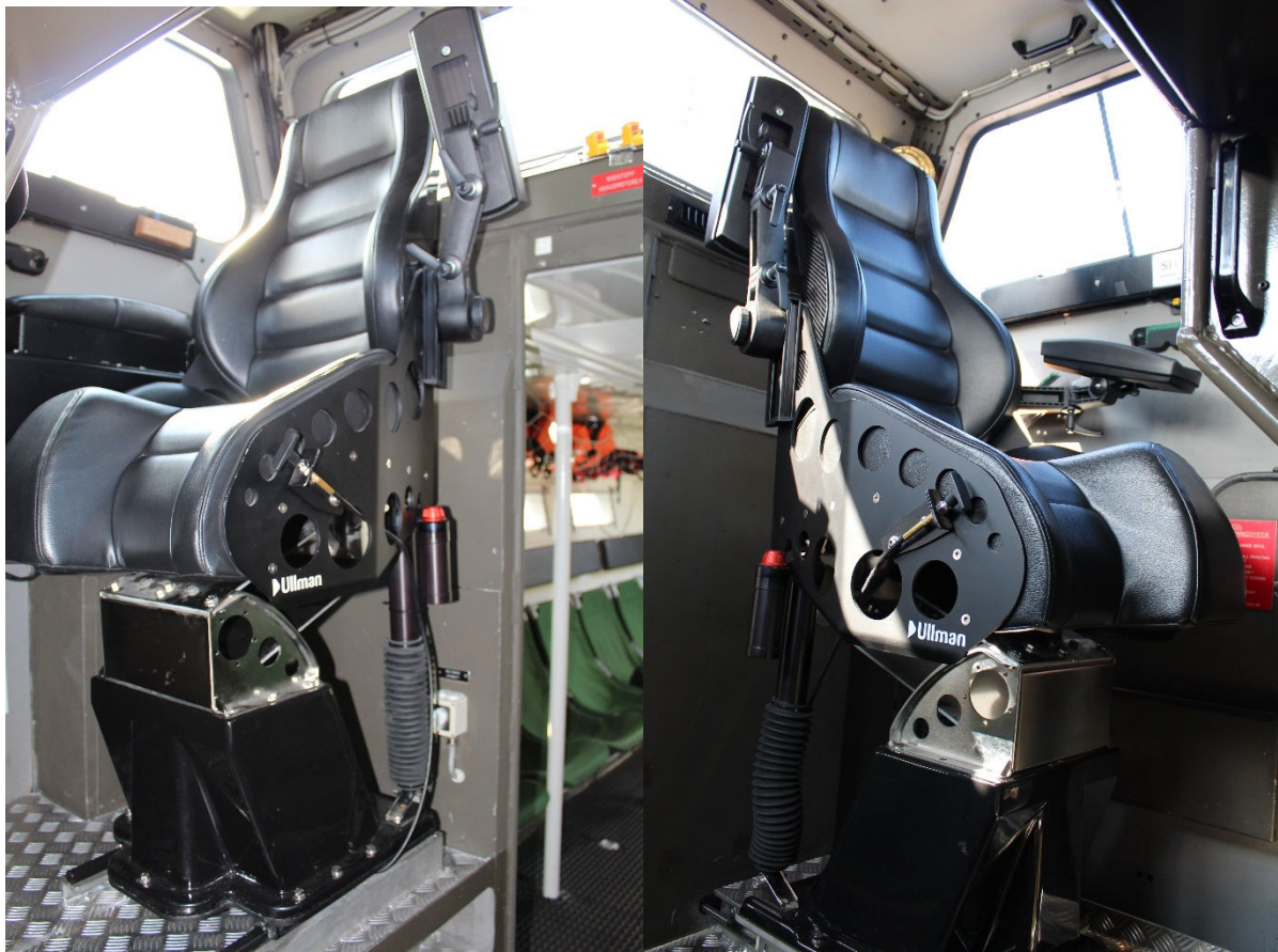
The Wheelhouse on Enforcer III is fitted with two Ullman Atlantic Seats for the Helmsman and Navigator.