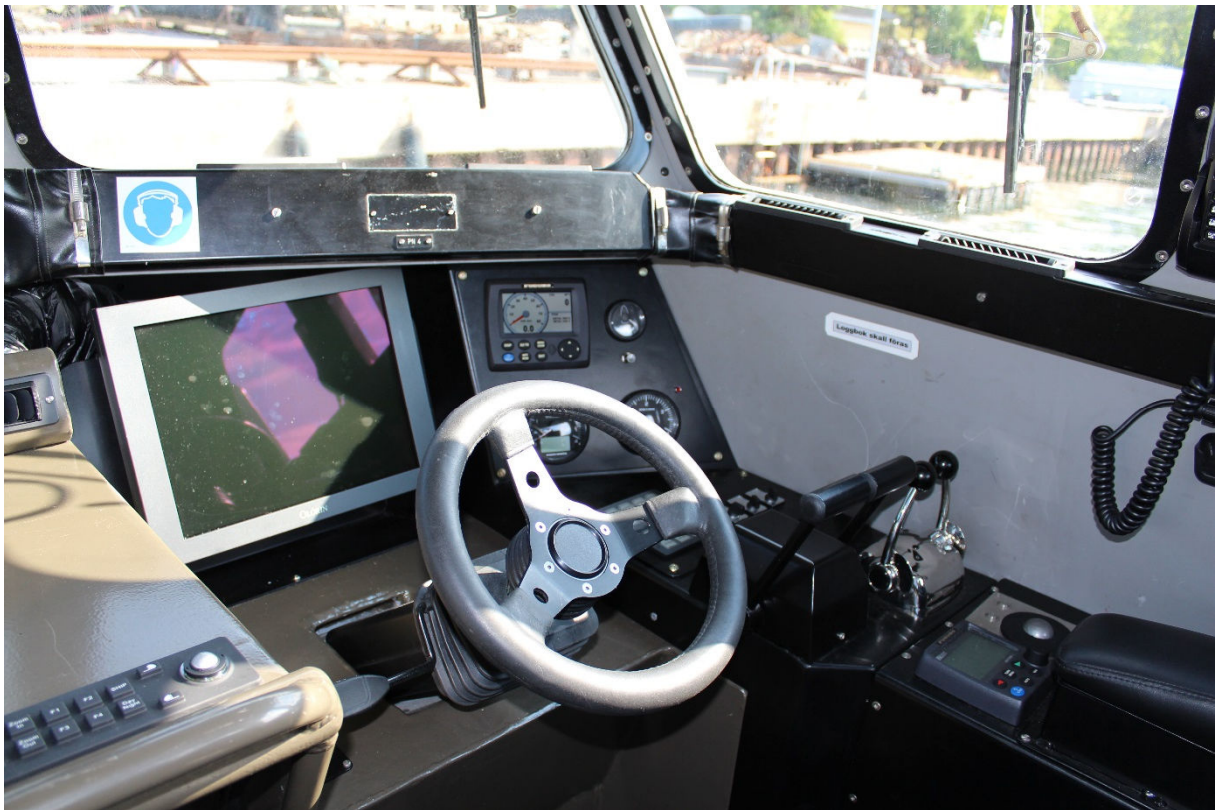
New VOLVO PENTA engine controls and a FURUNO NavNET 3D system is fitted in the Wheelhouse.