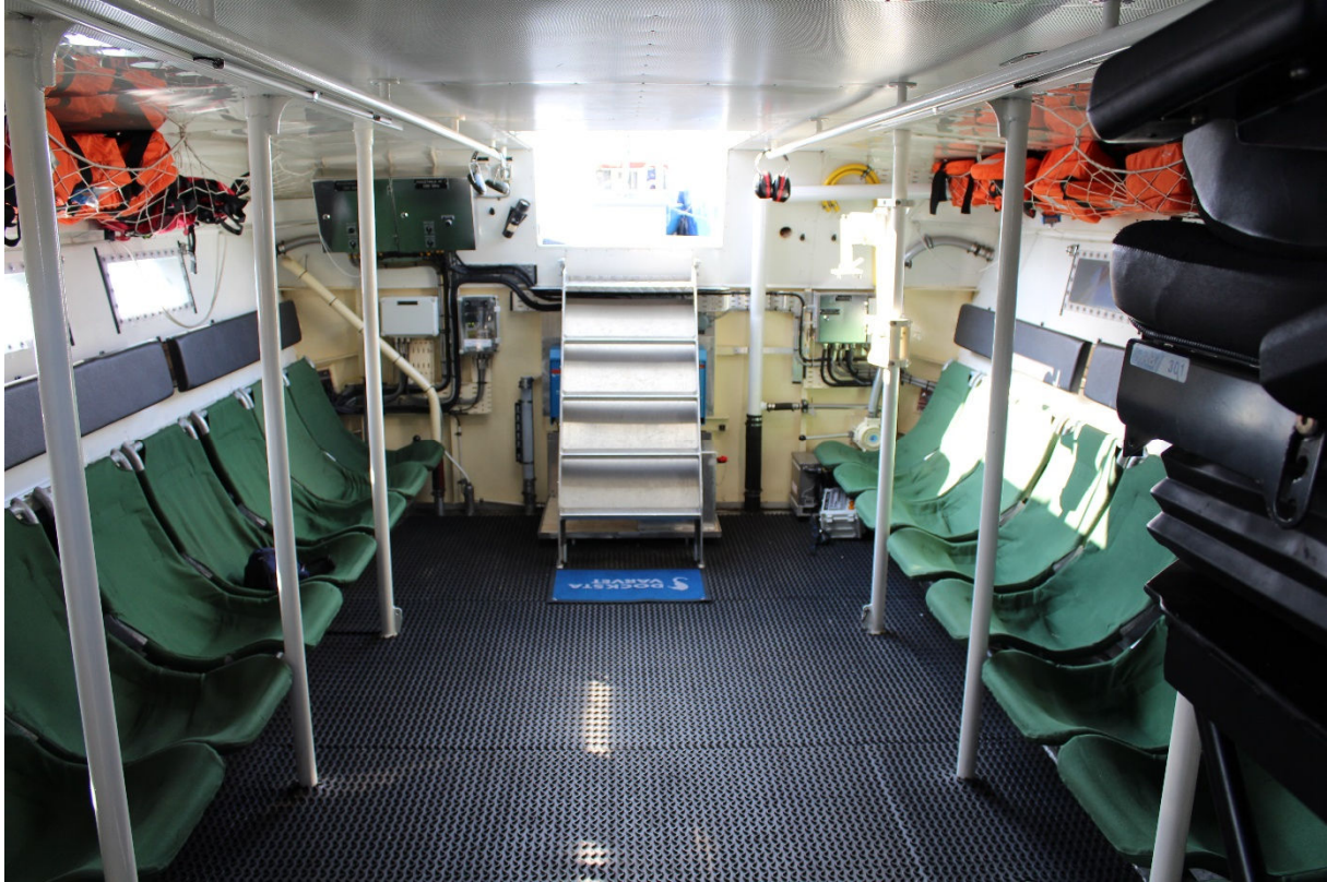
The Enforcer III is fitted with a standard accommodation comprising 18 troop seats in the Transport Compartment.