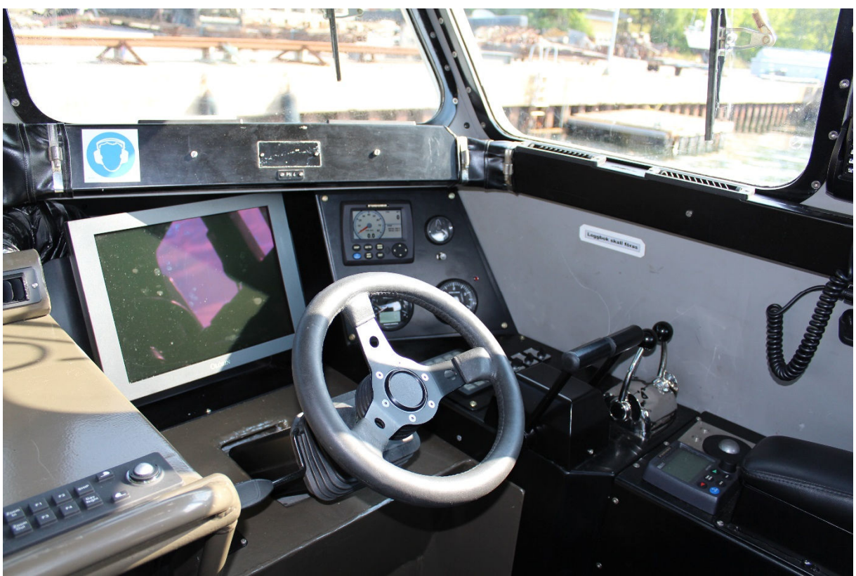
New VOLVO PENTA engine controls and a FURUNO NavNET 3D system is fitted in the Wheelhouse.