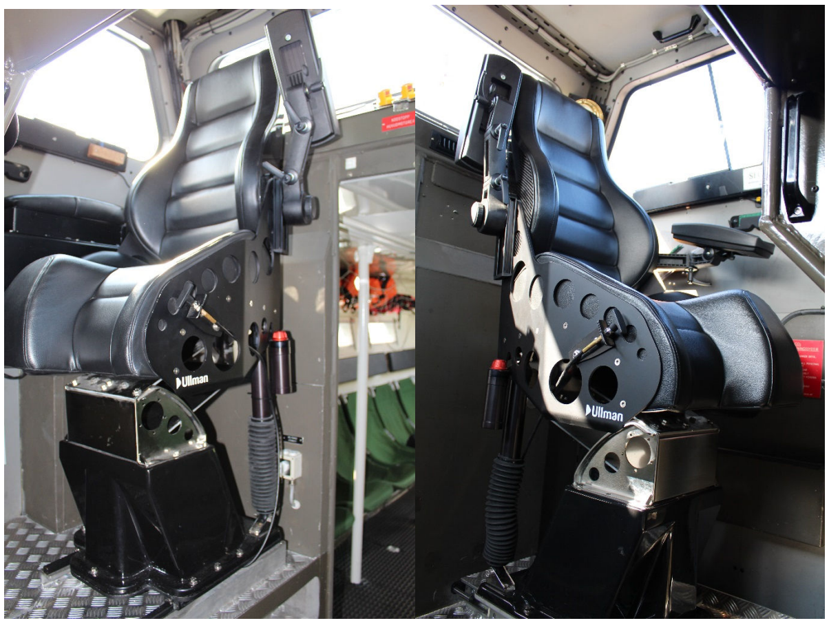
The Wheelhouse on Enforcer III is fitted with two Ullman Atlantic Seats for the Helmsman and Navigator.