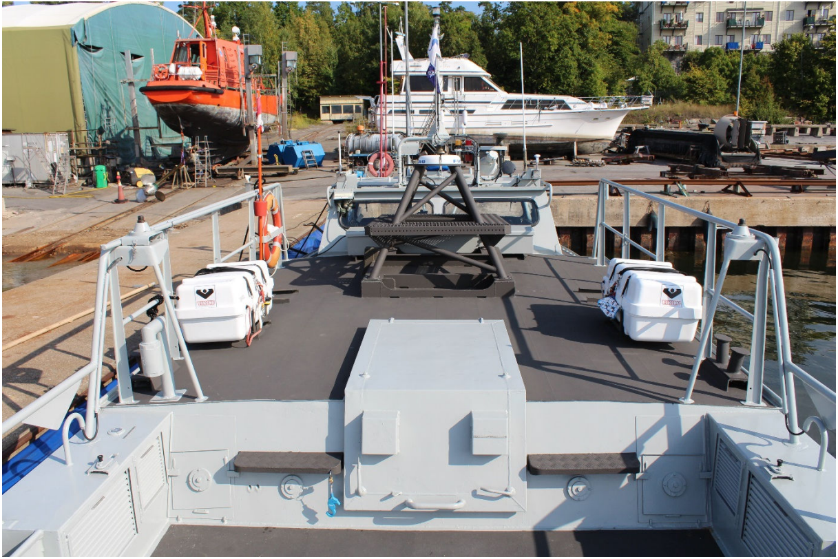
On Enforcer III the standard Ring Mount is replaced by a specially designed foundation for an RWS (Remote Operated Weapon).