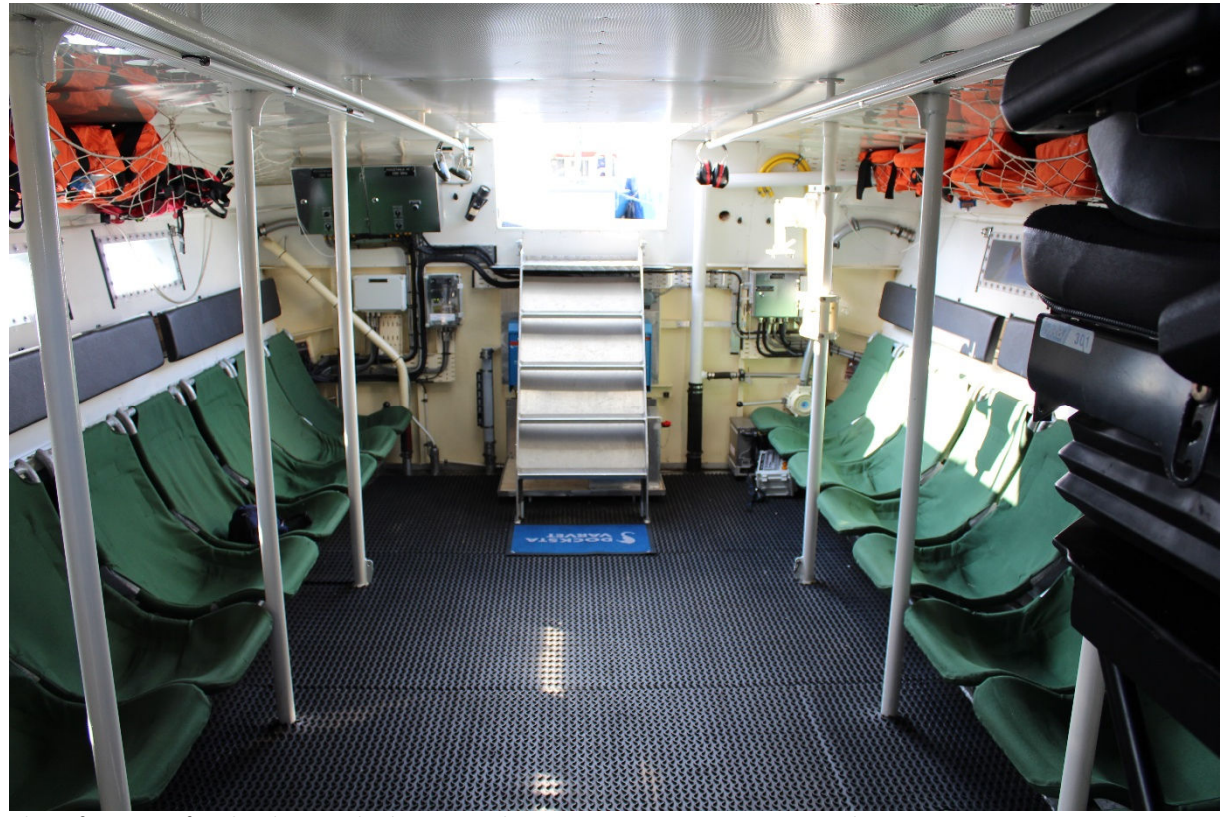
The Enforcer III is fitted with a standard accommodation comprising 18 troop seats in the Transport Compartment.